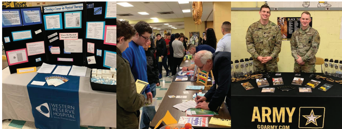
Just three of the 68 organizations that participated in this year’s Career Night at CFHS.